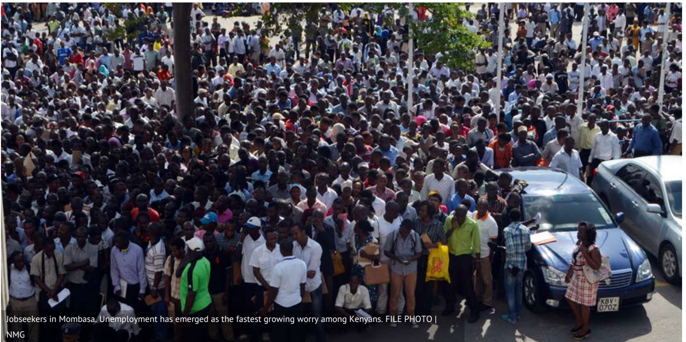
Jobseekers in Mombasa. Unemployment has emerged as the fastest growing worry among Kenyans.

MONDAY, JUNE 8, 2020 8:00 BY NG'ANG'A MBUGUA