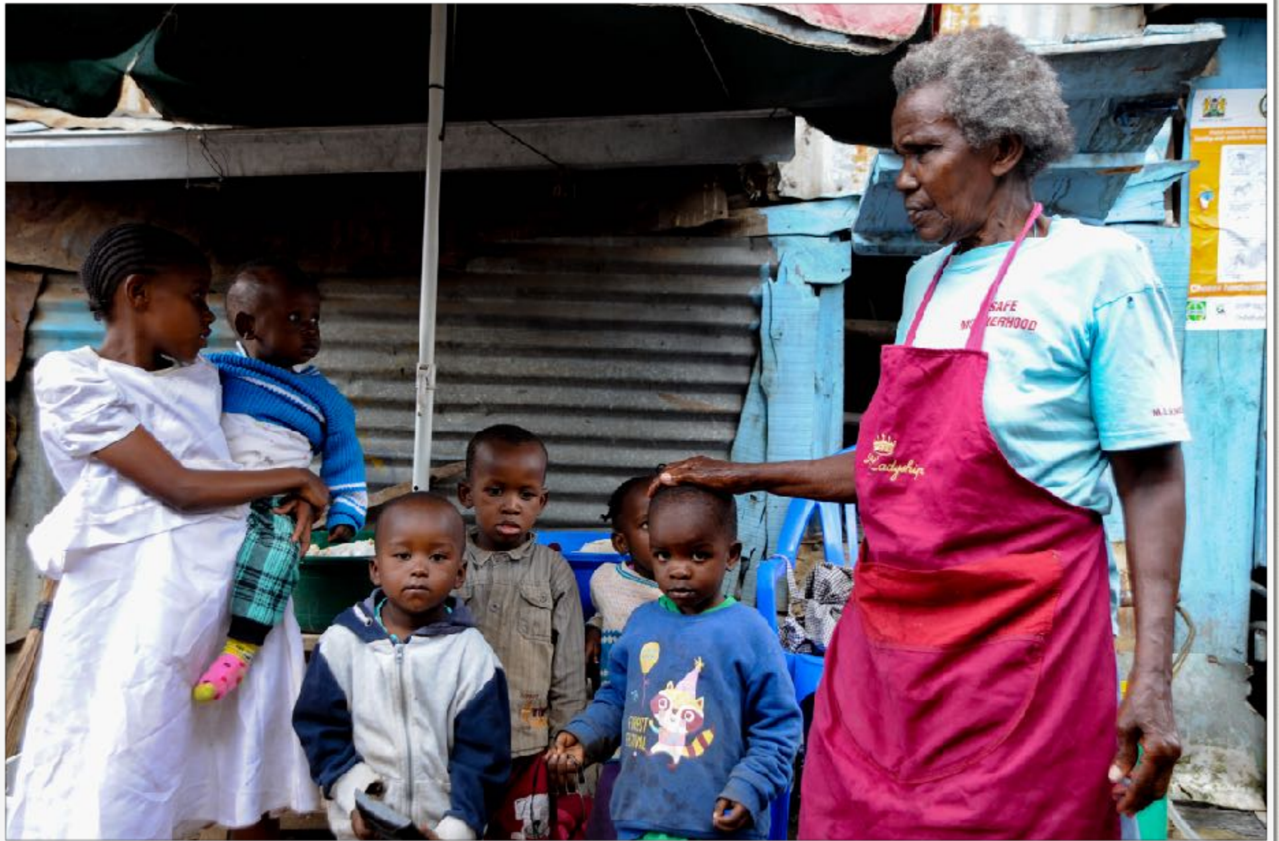
We had employed six workers they were all jobless today.